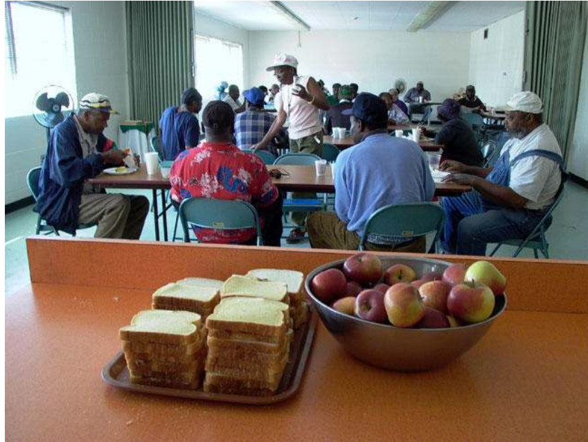
(Dorothy Day Soup Kitchen)

Therefore, it seems to me that soup kitchens throughout the nation need to undergo reform. The nutritional quality of the foods and the manner in which it is divided does not seem sufficient. As dietetic students, we hold a duty to aid in these transformations. We may begin by volunteering, such as my class did, to gain new perspective on the issue and more importantly, to help those in-need. Even though the current system isn't perfect, people can't wait for corrections to be made before they eat. Help is needed now. So don't just think about the hungry during the holidays or when you are required to do volunteer work; make your contribution today. I believe these contributions will eventually lead to an improved system of feeding the hungry, one that will help them become more independent as well as healthy.